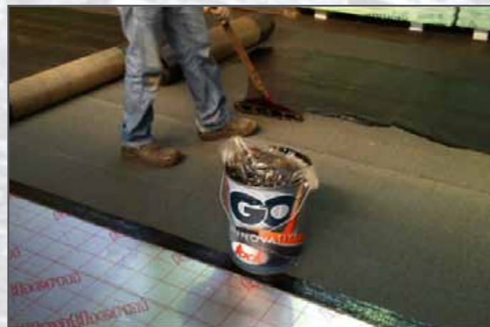
▶ Cold adhesive - IIGO