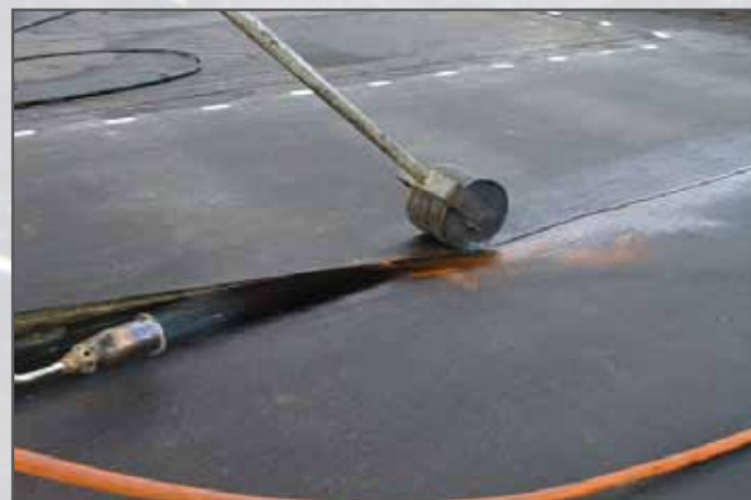
▶ Mechanically fixed with bonded